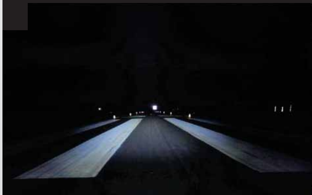
First Cone 210' Target 300'