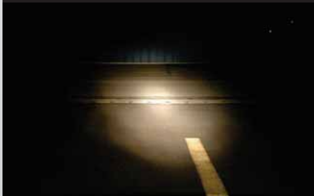
1/15th ISO 1600