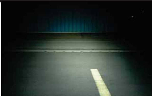
f/5 1/15th ISO 1600