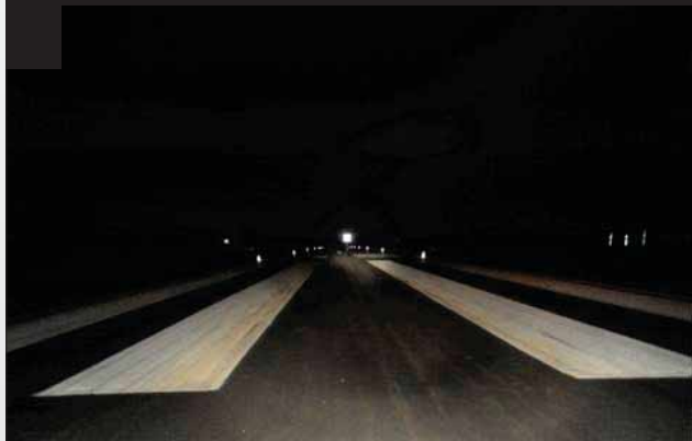
First Cone 210' Target 300'